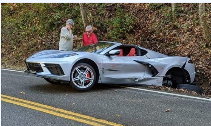
“Do you think the front right tire might need some air...?”