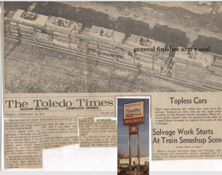
general finishes arm r seal

Story and illustrations by Alex Beloff III