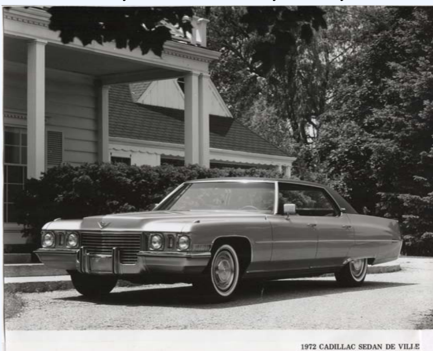
1972 CADILLAC SEDAN DE VILLE